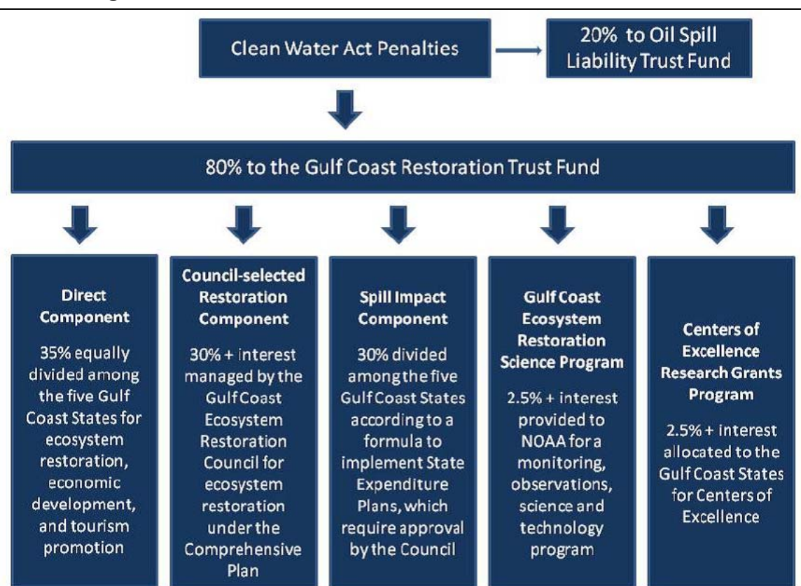
Figure 2. RESTORE Act Distribution of Clean Water Act Penalties